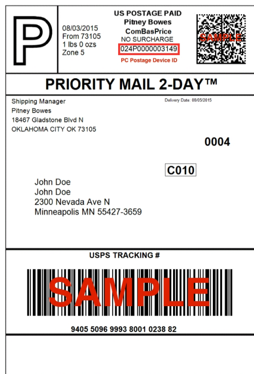
Figure 2: Locating the PC Postage Device ID on an IOP label