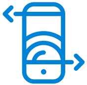
01 Automatic alerts