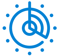
03 Anytime access