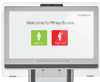
Users sign in through an easy-to-use touchscreen interface.