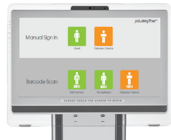
Step-by-step visual cues to assist users through the sign-in process.