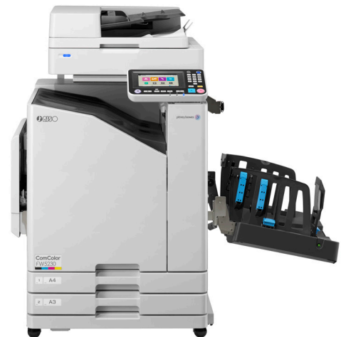
Auto-Control Stacking Tray II