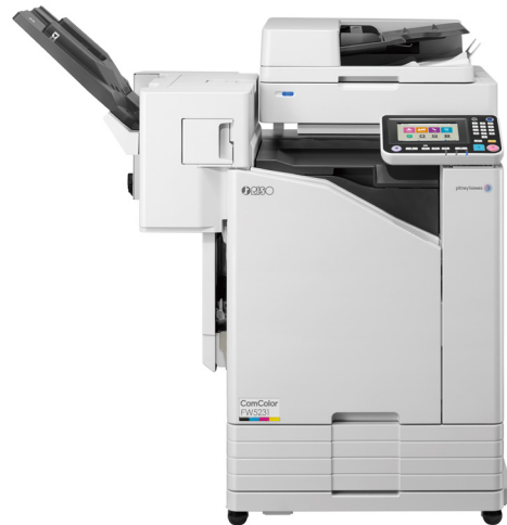
Staple and offset stacking

The optional IC Card Authentication Kit enables user management using an IC card.