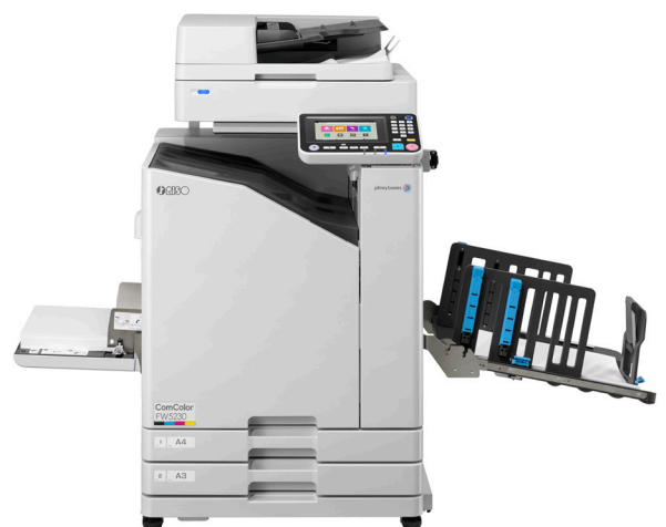
Wide stacking tray