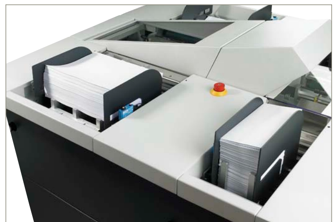
Sheet and insert feeders hold 1,000 and 1,500 items respectively