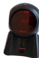
Omni directional scanner