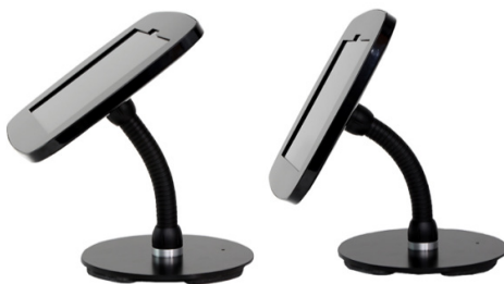
Multi-adjustable viewing angles.

The Counter Go and Pro come with a scanner and label printer.