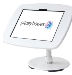
Secure tablet enclosure.