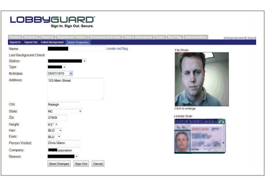
Easily register and capture visitor data with built-in ID scanner.