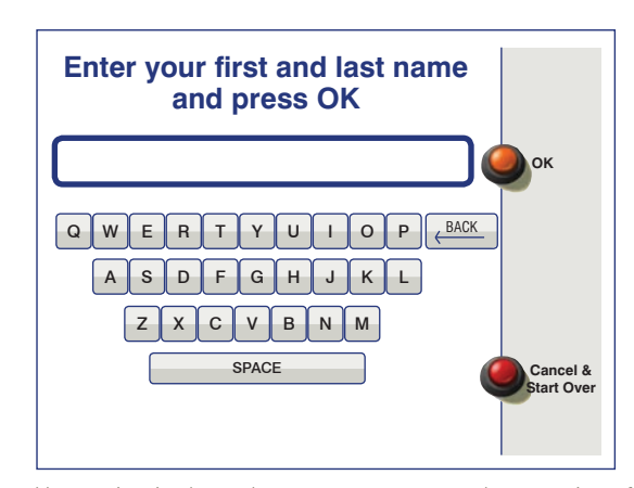
Users sign in through an easy-to-use touchscreen interface.