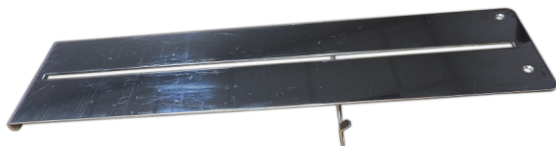
Long Media Support: For media over 14.25" (362mm) long (up to 20" (508mm) long)

Specifications are subject to change without notice.