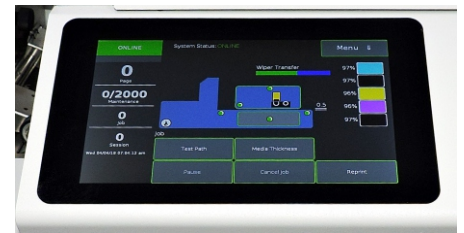
Easy to use: Large touchscreen provides full printer control and system status!