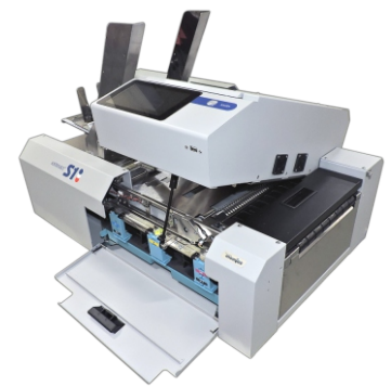
Easy to maintain: Quick access for fast cleaning and service