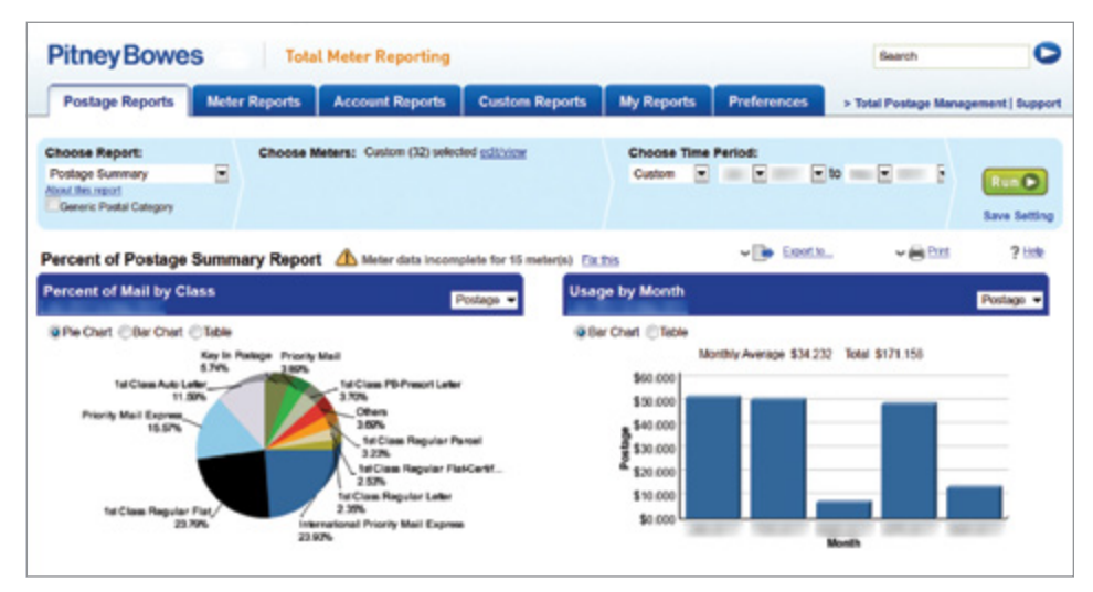
Total Meter Reporting