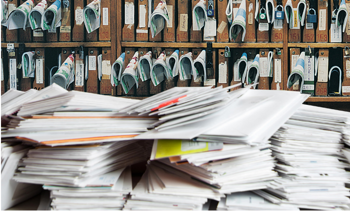
Conventional mail processing

digitally to the intended recipient. In addition, our solution is 100% compliant to regulatory archiving rules. Globally, organizations such as banks, government agencies and hospitals have converted to this modern, time-saving method.