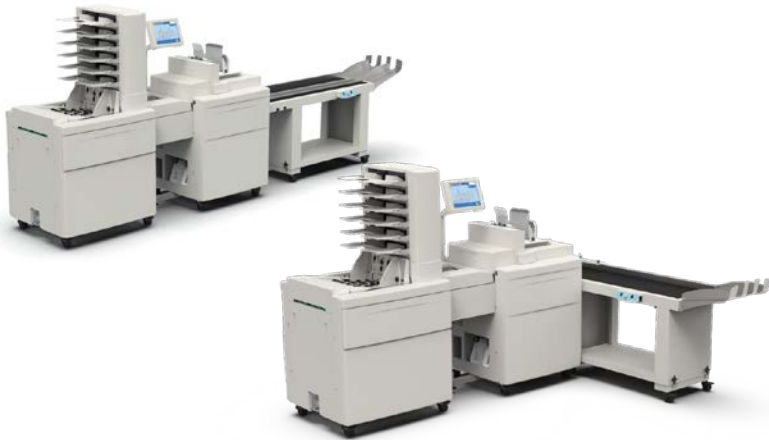
Single tower w/o folder