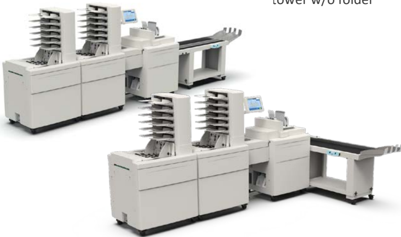
Double tower w/o folder