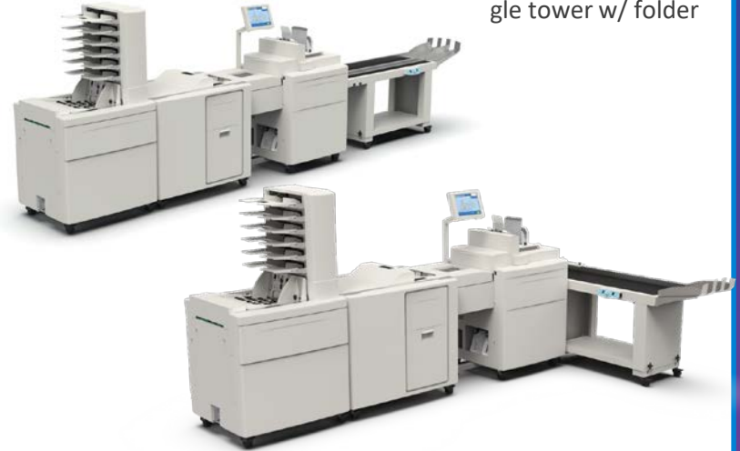
Single tower w/ folder