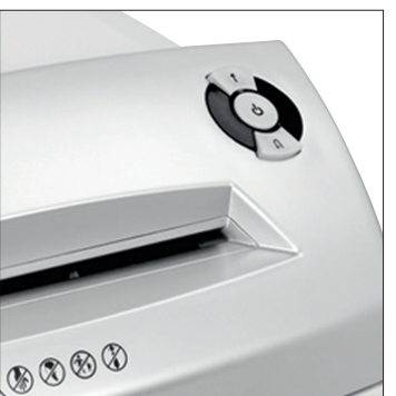
Intelligent controls with illuminated status indicators

Dynamic Load Sensor and indicator to ensure paper is fed at the optimal rate