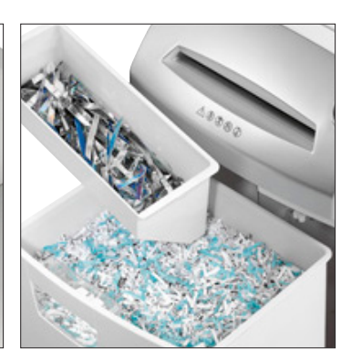
Separate collection chambers keep paper and non-paper waste segregated