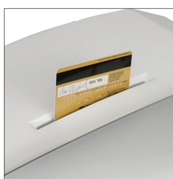
Separate feed slots for credit cards, ID badges and optical media