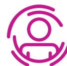
Integrated temperature check