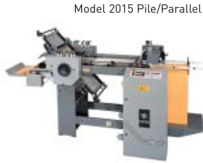
Model 2015 Pile/Parallel