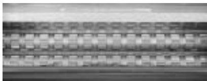
Model 2015 Pile Feeder Parallel • 8-Page • Stacker

The steel helical gears are coupled to the fold rolls providing solid reliability. A positive gear drive assures no slippage between fold rolls for more consistent folds.