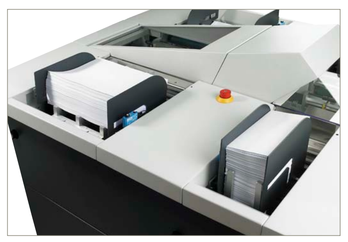
Sheet and insert feeders hold 1,000 and 1,500 items respectively