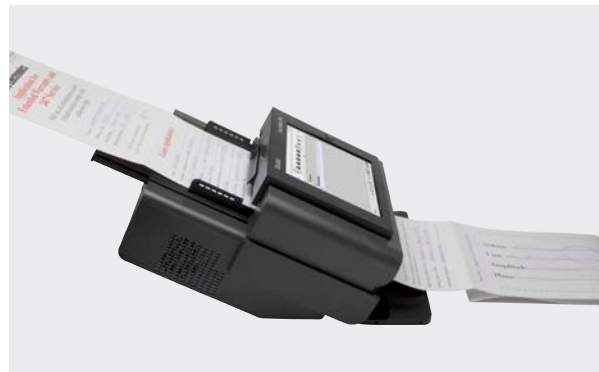
Improved paper handling