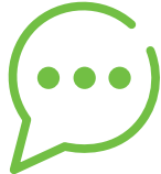
Chatbot onboarding experiences