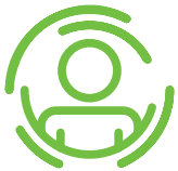
Single Customer View

Data accuracy and customer insight make your programs more efficient and targeted. Innovative ways to connect with customers across channels create more engaging experiences that build loyalty, reduce costs to serve and grow revenues.