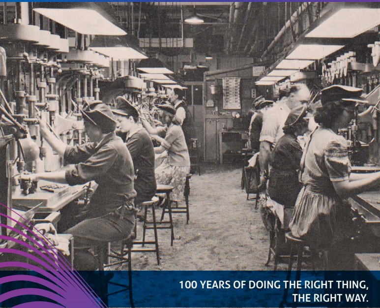
100 YEARS OF DOING THE RIGHT THING, THE RIGHT WAY.

It's easy to solve mailing challenges when you work with the right company.