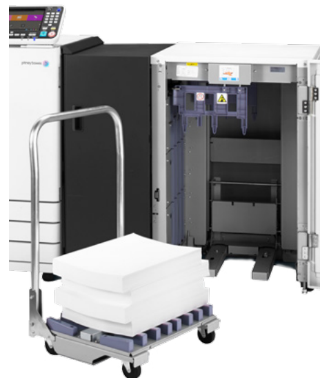
Cart not included with High Capacity Stacker.