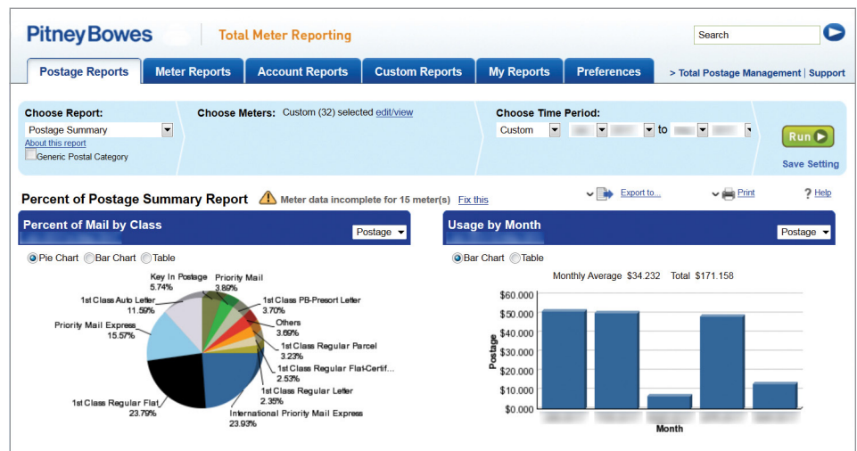
Total Meter Reporting