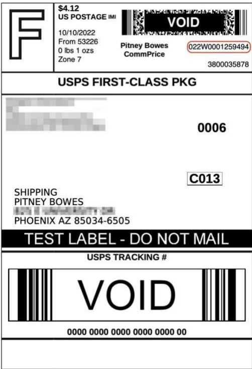
Figure 3: Shipping Label