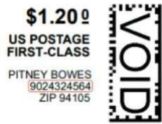
Figure 1: IMI-MIN Stamp