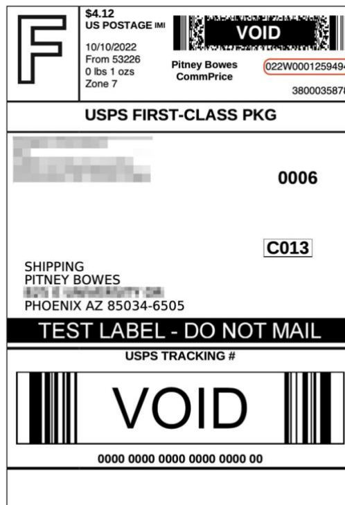
Figure 3: Shipping Label