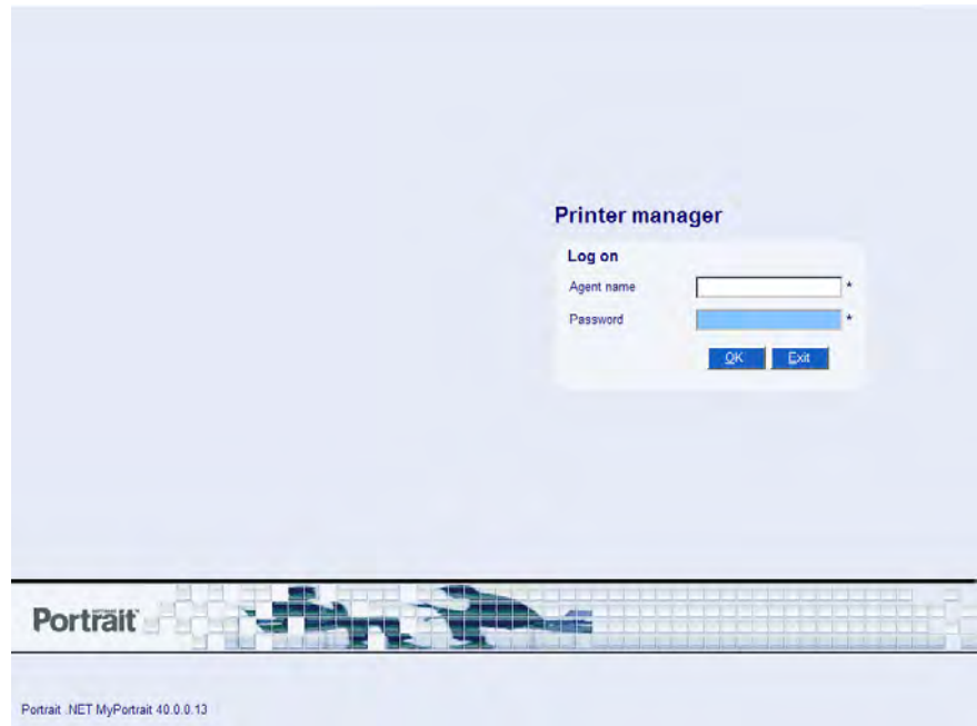
Figure 1 -Log on dialog

Enter the User ID for the agent and the Password . The agent must have the role Administrator to be able to log on.