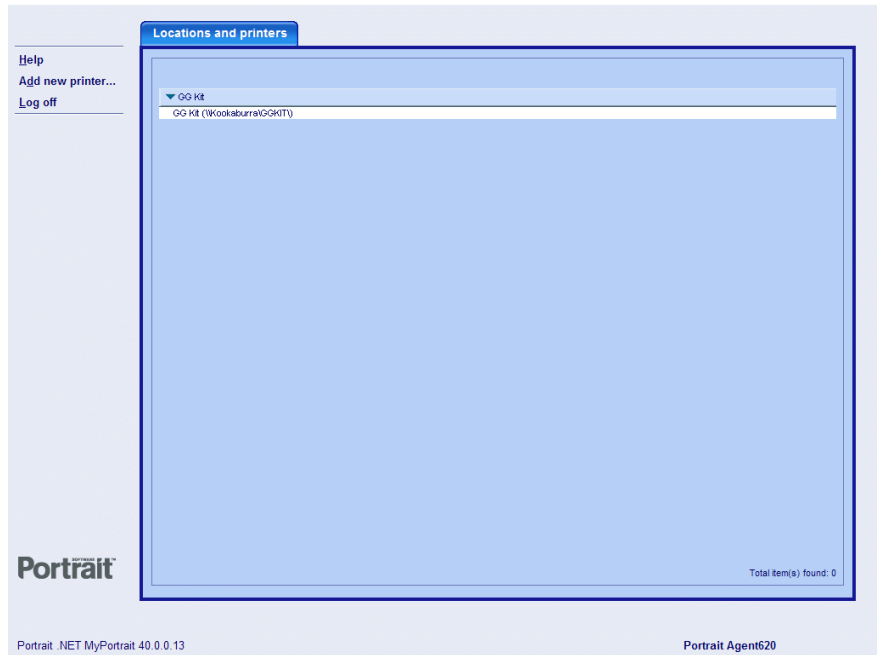
Figure 2 -Locations and printers page

The page lists the printer locations which have been defined in configuration. To display the physical printers for a location, expand the location by clicking on the arrow symbol.